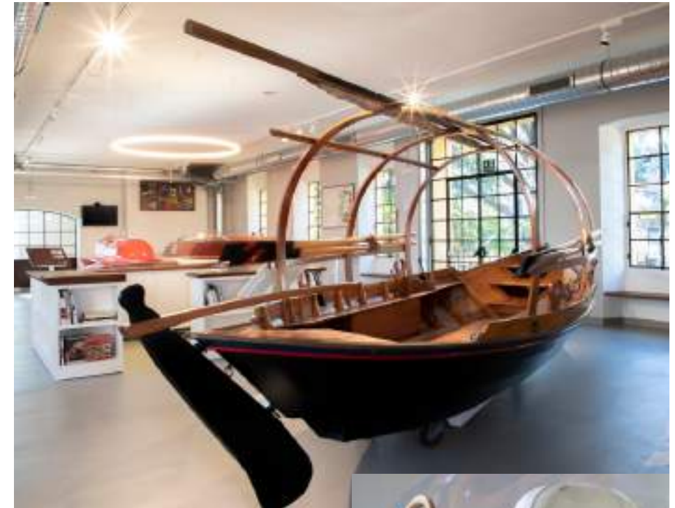
Museo Barca Lariana - Pianello del Lario