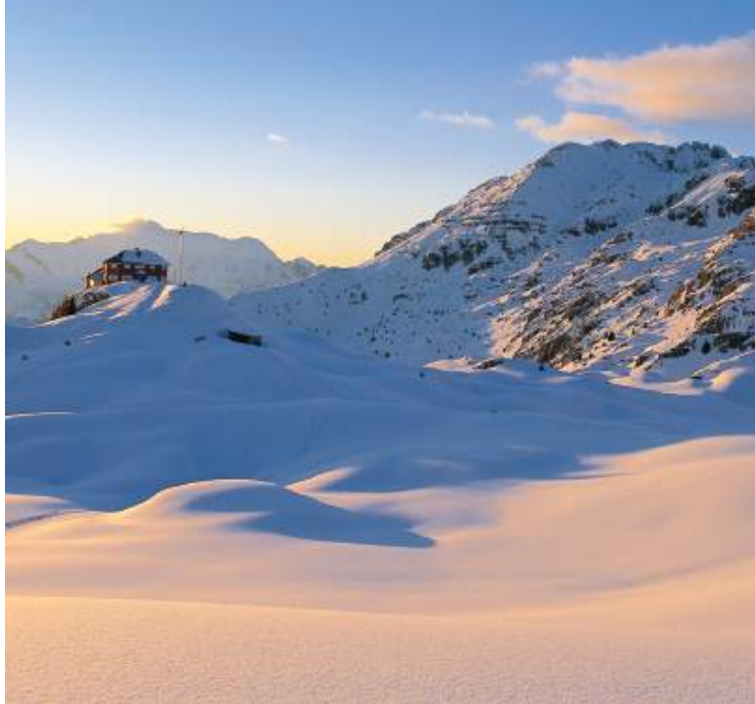
Large image Piani di Artavaggio

The Alpine area surrounding Lake Como is a real treasure that is best discovered by eco-friendly slow tourism, revealing the area in all its beauty. A network of trails, some also suitable for mountain biking, allow you to switch from strolls to more challenging hikes. You can also enjoy rock climbing here, as well as Alpine skiing, Nordic walking and all manner of outdoor activities. The Grigna massif, Resegone, the Corni di Canzo, Monte Grona, Monte Barro or Legnone are just a handful of the most famous peaks, which are real-life rock climbing walls and a hiker's paradise. And then there are the valleys, just waiting to be explored: Valsassina, Valvarrone, San Martino Valley, the Intelvi Valley, Menaggio Valley, Sanagra Valley, Cavargna Valley, Valassina and the Upper Lake valleys, which for centuries have symbolised the true identity of this land.