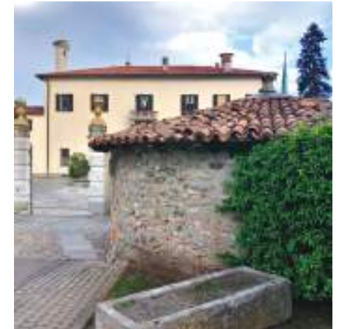
Small image Villa Imbonati, Cavallasca