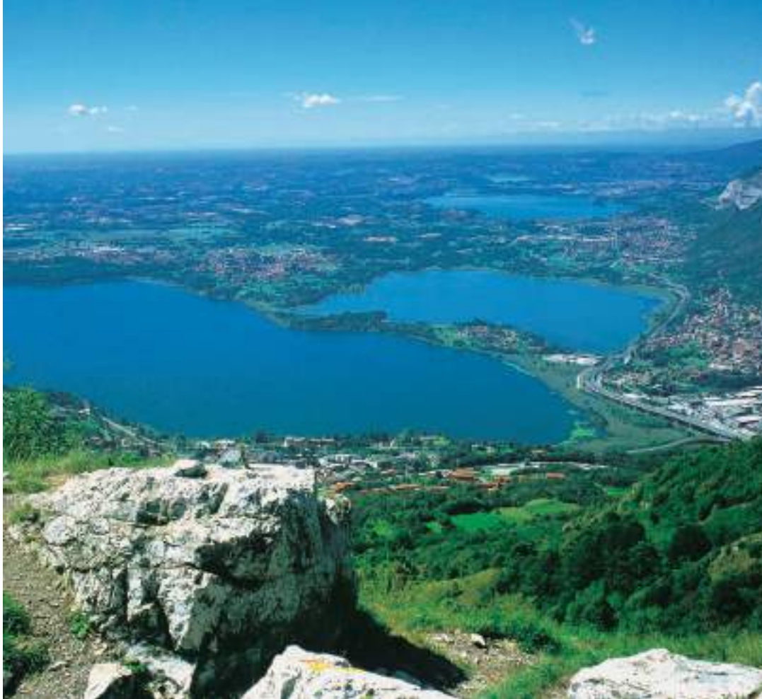
Large image The Brianza Lakes

Between the two branches of Lake Como, where the Triangolo Lariano mountains gently roll into plain, lie the Brianza lakes, five little stretches of water, yours to explore at a leisurely pace, amidst woodland and reed beds. The first, to the east, on the doorstep of the town of Lecco, is Lake Annone, with one of Brianza's most stunning cycle paths running round it. This lake has the most peculiar shape, squeezed to a narrow channel in the middle, where the ancient town of Isella sits. If you're passionate about sport, you'll find everything you love right here, from cycling and hiking to kayaking and paragliding. Lake Pusiano is a protected area where visitors can take a trip on one of the electric ferry boats to admire a close-up view of Cipressi island, a private islet whose garden abounds with rare tree species, birds and exotic animals. The little lake is also home to a highly specialised rowing centre, a training ground for crew from all over the world.