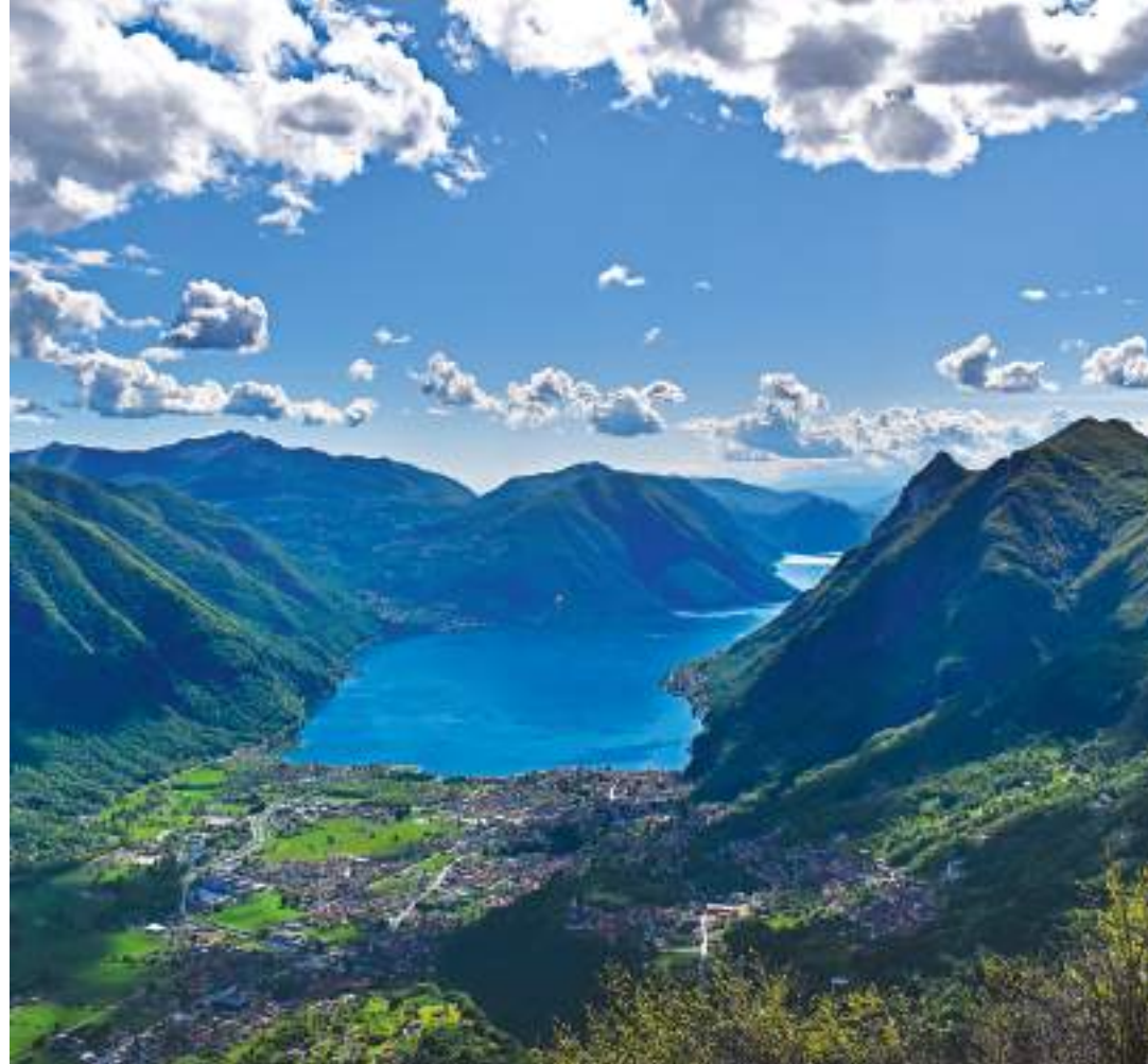
Large image Lake Ceresio

Lake Ceresio, better known as Lake Lugano, is tucked between Italy and Switzerland on the southernmost tip of the Canton of Ticino. The province of Como encompasses a part of the lake, from the border at Gandria, Oria Valsolda, as far as the well-known little town of Porlezza, and all the way round to Claino con Osteno with the Rescia caves and upper hamlet known as the “Borgo Dipinto”, or “Painted Village”, where the houses are embellished with artwork. This unique lake and mountain landscape boasts cycle paths, tiny beaches, hiking trails, ancient churches, and villages that climb up the hillsides from the shore, linked by the Lake Lugano ferry boats. A “Little World of the Past” as Antonio Fogazzaro described it in his famous novel, the spirit of which lives on in Villa Fogazzaro Roi, in Oria, a hamlet in Valsolda, where the writer stayed for quite some time and which is now owned by the National Trust for Italy (FAI). The municipality of Campione d’Italia on Lake Lugano is hemmed in all around by Swiss land. This quirky Italian exclave belongs to the province of Como. Best known for its casino, the little town is a treasure trove of artistic gems, such as the Santa Maria dei Ghirli church, a legacy of the tradition of craftsmen, sculptors, architects and painters known as the Maestri Campionesi school.