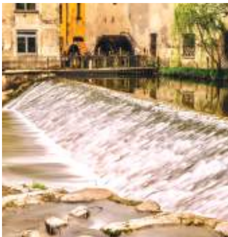
Small image Mill on Lambro river

Located towards the north, in an already pre-Alpine landscape, you'll find Lake Segrino, with tiny beaches, a roughly 5-km walking and cycle path and rowing boats and canoes to hire. With its underground springs and zero pollution, Segrino is considered to be the cleanest lake in Europe. Lake Alserio, once connected to Lake Pusiano, is surrounded by pastures and reed beds within the Parco regionale della Valle del Lambro. The area is a real haven of relaxation and fun for trips out and picnics, with easy, enjoyable paths to walk or cycle along, leading to lakeside towns and villages. Just outside the city of Como lies little Lake Montorfano, with 2.5 km of shoreline dotted with woods and reed beds. This nature reserve is overlooked by a fully equipped lido with bathing facilities and the prestigious Villa d'Este golf club. It