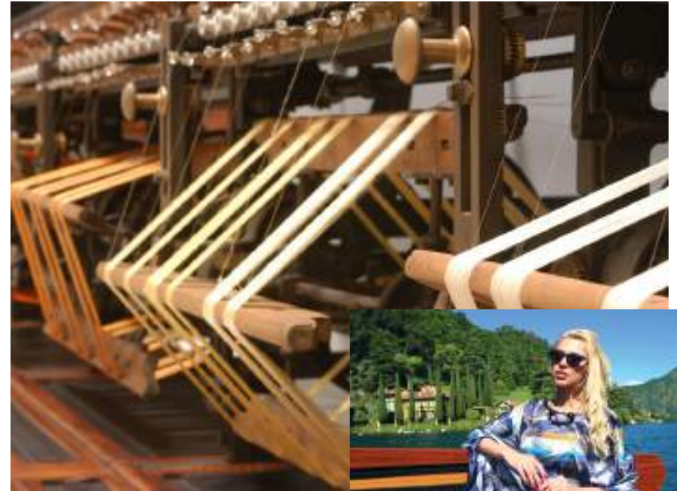
Large image