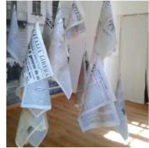
Large image Montecchio Nord Fortress

The ancient Piona Priory — a 12th-century Benedictine abbey that is a rare jewel of Lombard Romanesque architecture — is perched above the Olgiasca peninsula just south of Colico. The monastic complex, steeped in peace and tranquillity, is made up of the austere San Nicola church — with the typical spirituality of medieval Benedictine churches — and the picture-postcard cloister, the focal point of monastic life, with 41 columns embellished by capitals carved with designs and symbolism in the Romanesque style. The abbey, also accessible by boat, is still lived in today by Cistercian monks who allow year-round visits to this place of prayer and who run a small shop selling products from the Priory's workshops.