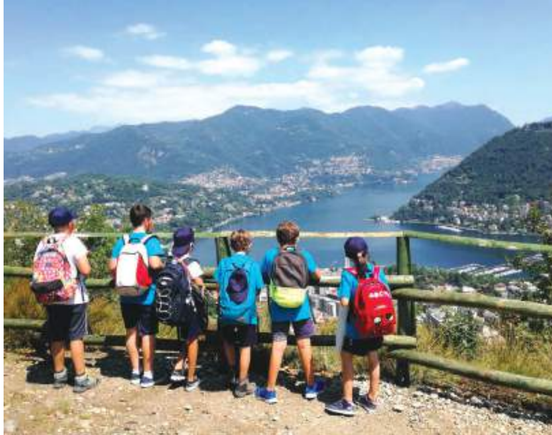
Large image Panorama from Spina Verde Park