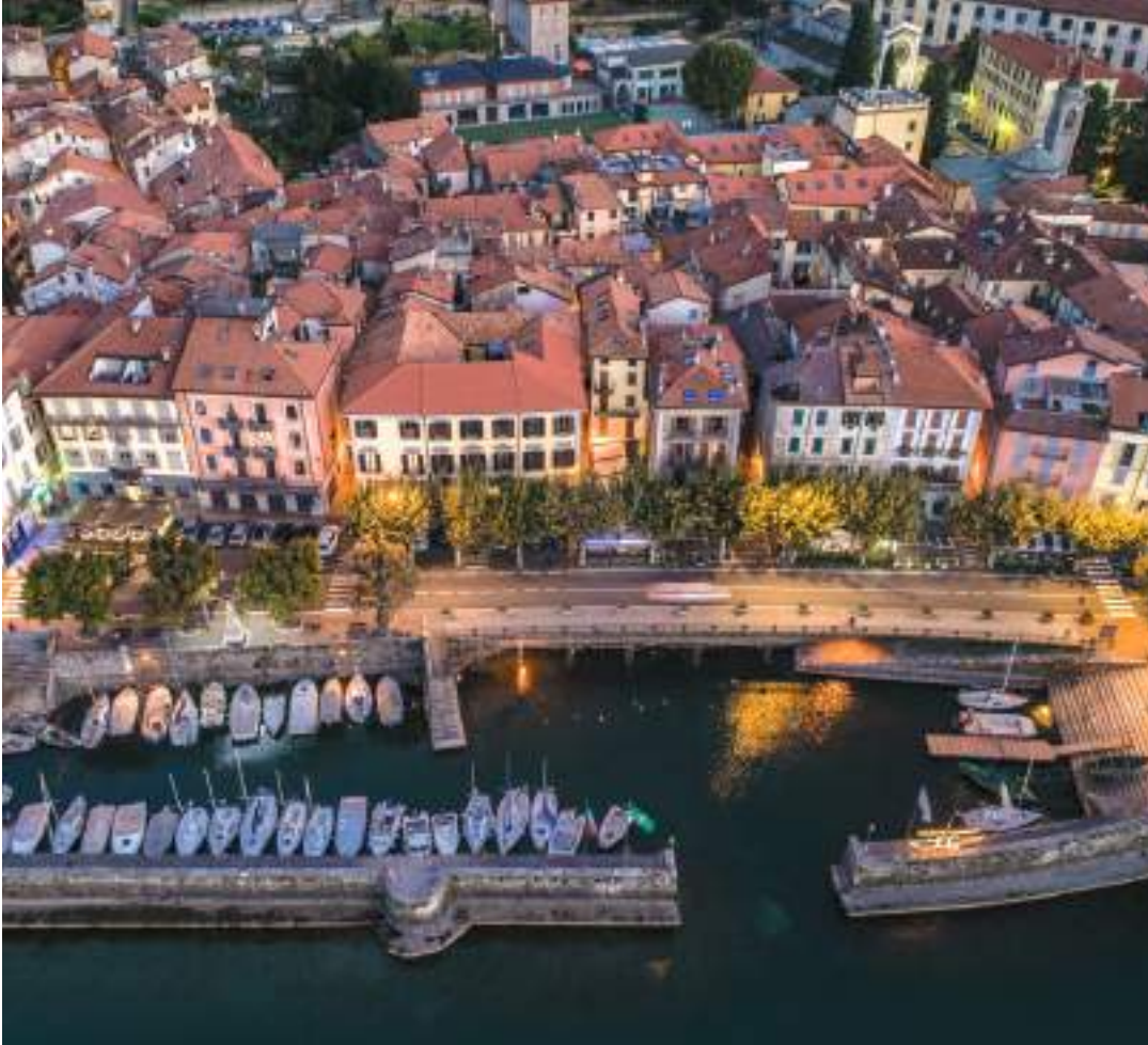
Large image Bellano

Located just a few kilometres from Lecco, Abbadia Lariana is named after an ancient Benedictine abbey, of which part of the cloister is still present to this day. In the 19th century, the local economy relied on silk, whose processing phases are described in the Civic Silk Museum in the former Monti mill. Today, Abbadia Lariana is a small tourist town offering not only bathing facilities, but also the opportunity to enjoy scenic hikes, such as the one to the spectacular Cascata del Cenghen waterfall. Mandello del Lario, associated for decades with the mechanical engineering industry, has found its calling in tourism with accommodation facilities, the beach, the fully-equipped lido with bathing facilities and countless opportunities to climb up into the mountains and enjoy outdoor sports. The town is the world-famous location of the plant of Moto Guzzi, the now-legendary eagle. You can discover the fascinating history of the legendary red motorbikes in the museum inside the factory.