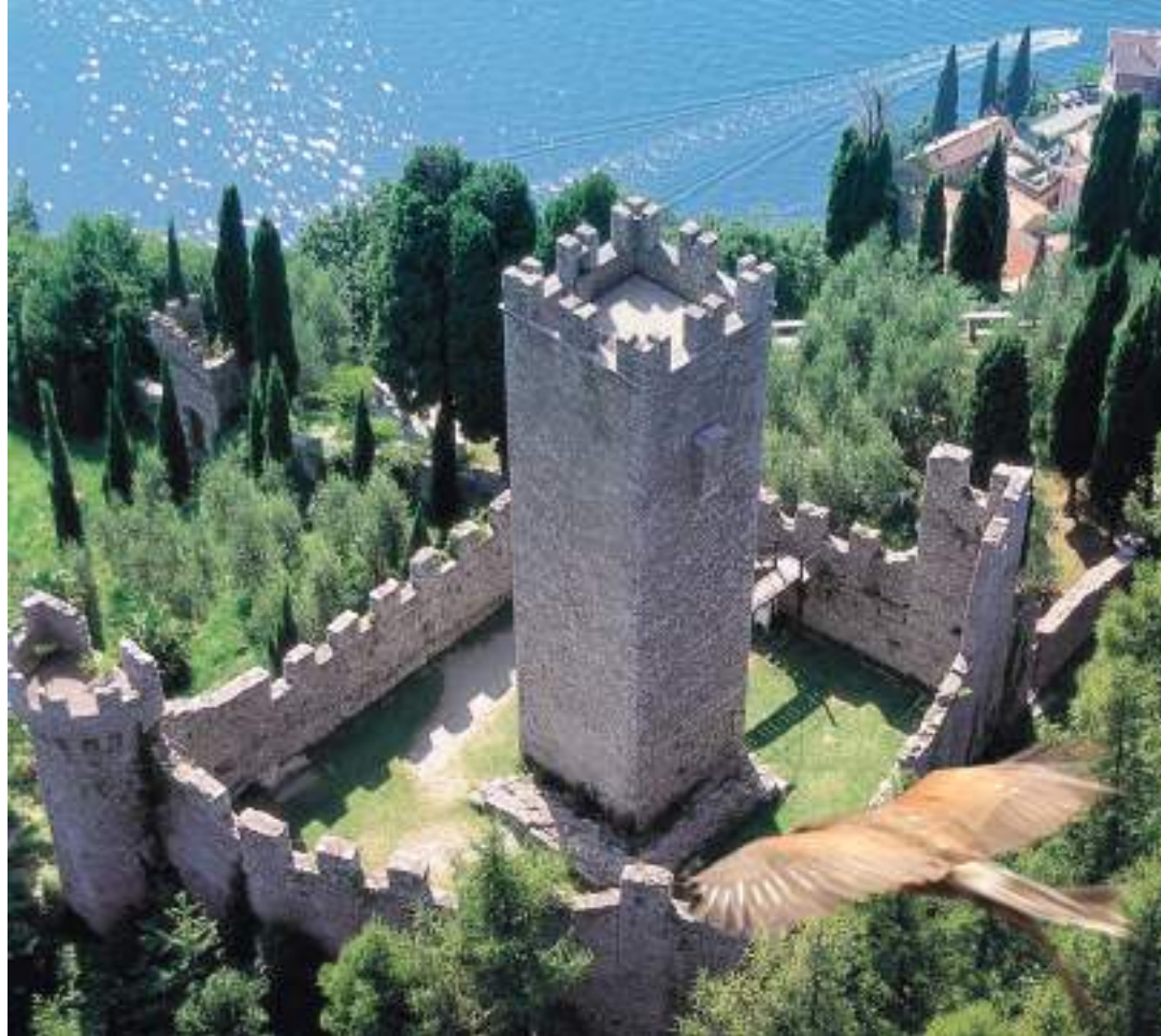
Large image Vezio castle