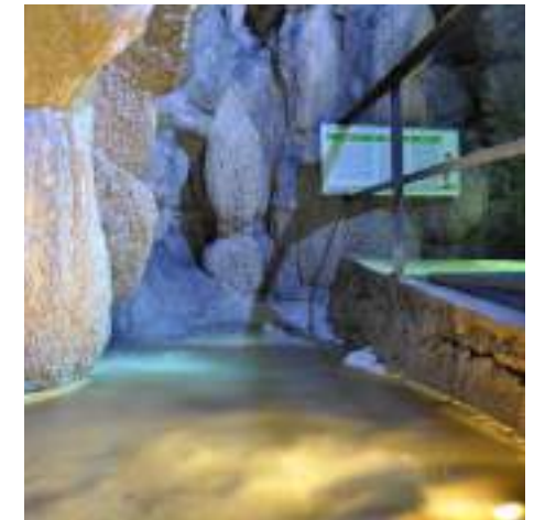
Small image Rescia caves