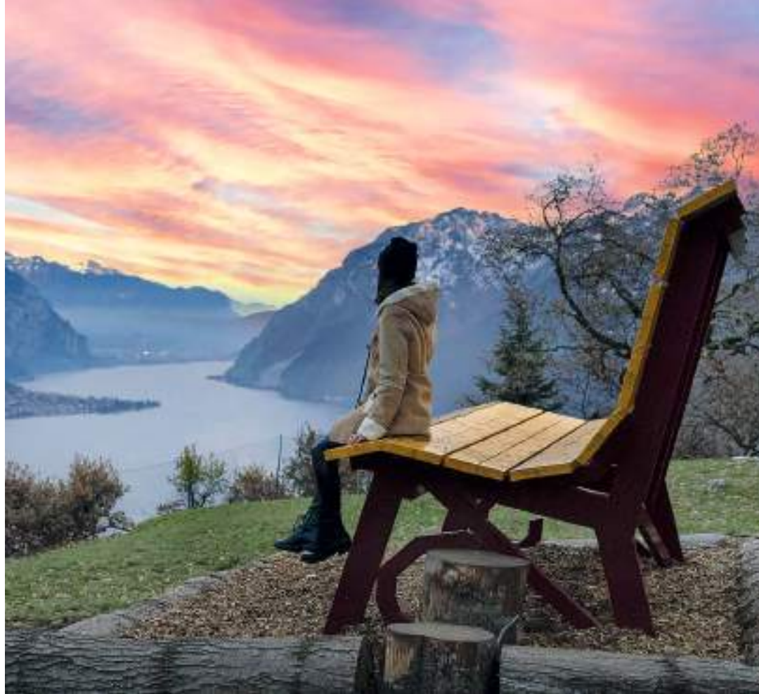
Large image Big bench, Civenna

The big bench in Fenegrò is right in the middle of the fields, just a stone's throw from the chapel devoted to Our Lady of Pompeii. This bench is easy to reach from the car park on Via Monte Grappa.